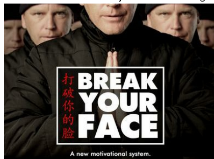
Break Your Face

Please visit my website for an extensive portfolio of my work. All of the work was written by me, unless otherwise noted. My website's URL is gregviljoen.com .