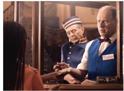
2018 on SuperSport