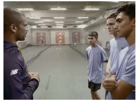
Check out my website